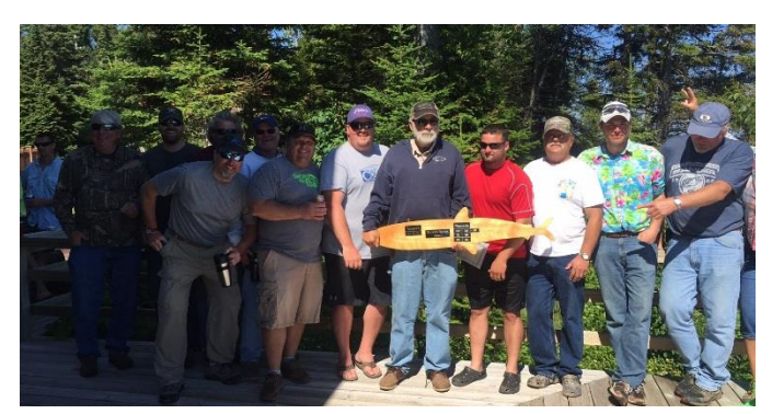
The Minnesota Fishermen with the Wooden Herring Award